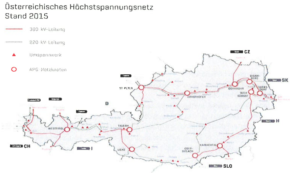
Figure 2: Map of the Austrian high voltage network and the location of the interconnectors

Table 2 summarises the information on interconnectors between Germany and Austria. The interconnectors below 220 kV voltage level are not included in this list since their contribution to transfer capacity is insignificant (i.e. their cumulative PTDF is below 1%).