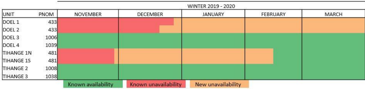
Figure 2.1 Change in the nuclear availability calendar during the winter months